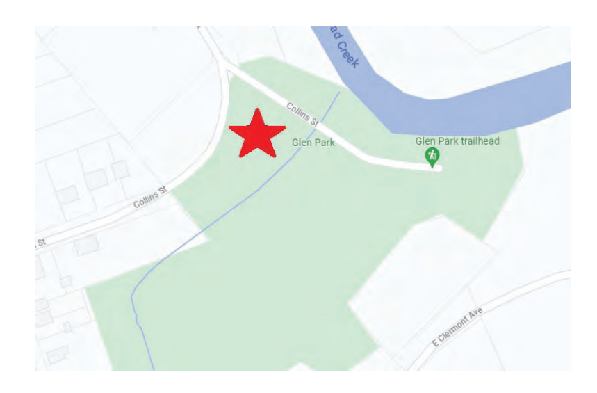
End of first part of Walking Trail - Glen Park - near 152 Collins Street, Stroudsburg, PA 18360