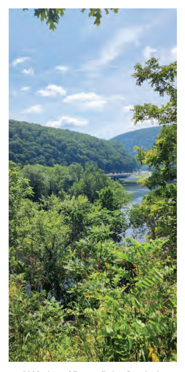
2023 view of Resort Point Overlook