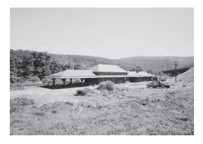
Delaware Water Gap Railroad Station

The Delaware Water Gap Station of the Delaware, Lackawanna and Western Railroad. The original station was constructed in 1856. The one you see now was built in 1903 and closed in 1953. It served on the main line between East Stroudsburg and Blairstown, N.J.