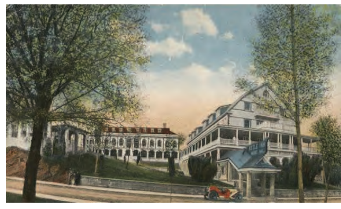
Castle Inn - 1909

• Turn south on Main St and head back to Delaware Ave, making a left onto Waring Drive.