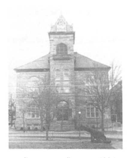
Courthouse Square - 1836