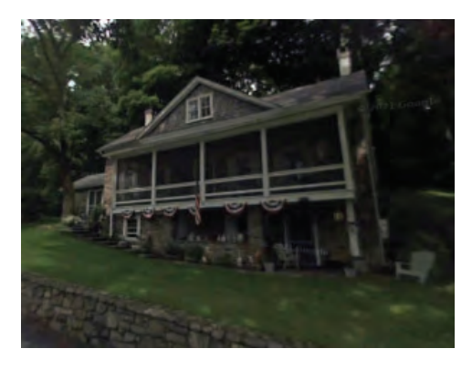
Old Stone House - 1734

• Continue along Cherry Valley Road towards Delaware Water Gap. Approx. 4 miles on your right will be an old stone house (1325 State Route 2006).