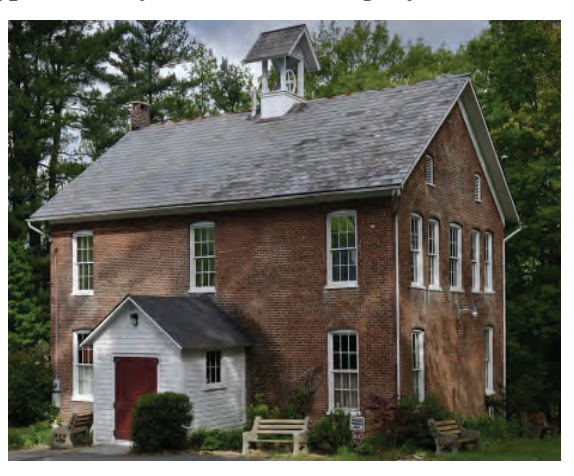
Dutot School - 1870