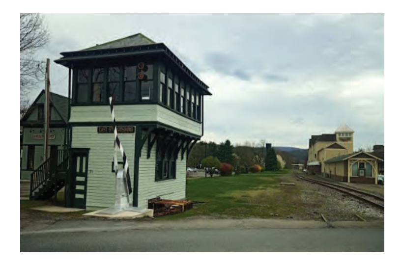
Railroad Switching Tower, East Stroudsburg