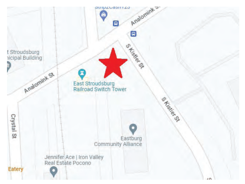
Start of Trail - 31 Analomink St., East Stroudsburg, PA 18301