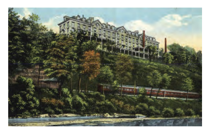
Kittatinny House - 1829

Once 611 re-opens, continue along 611 South by vehicle until you get to Resort Point Overlook. Park in the parking area for Resort Point Overlook. You can get out of the vehicles. This is where the Kittatinny House once stood.