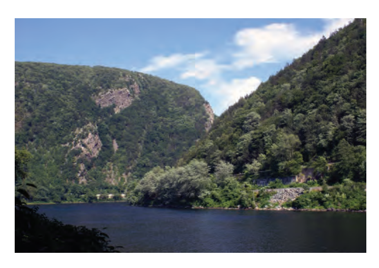
Delaware Water Gap

By the eighteenth century the migrations of the Pennsylvania Germans, Welsh and English coming from Philadelphia north to the Poconos came through the Wind Gap. Others came across from New Jersey. It wasn't until the end of the 18th Century, however, that the flow from the south eclipsed that from the north.