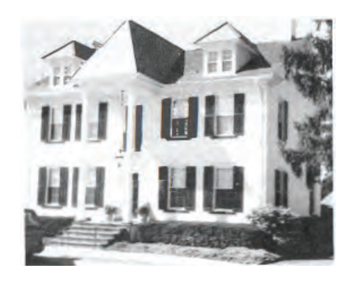
Hanna Stroud Starbird House - 1790